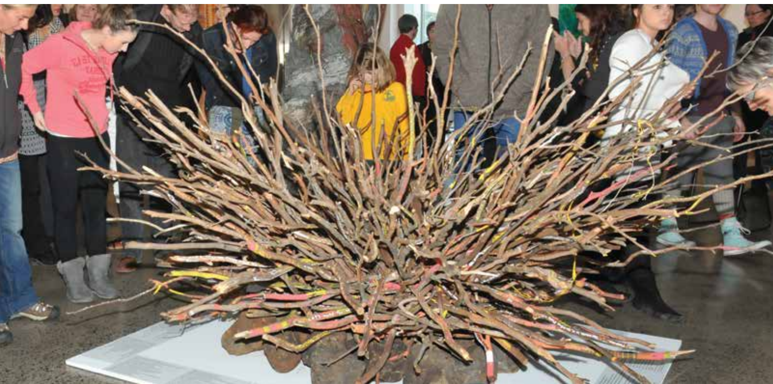
Image, top: Buninyong Primary School students with their painted-message sticks used to build Bunjil's Nest . Image, bottom: Bunjil's Nest at the launch of the completed project, June 2012.

The Eureka Education program has been hosted by the Gallery during the redevelopment of the Eureka Centre and continues to be successful. The Program provides a unique opportunity for students to gain a deeper understanding of life on the Goldfields and the issues, events and outcomes associated with the Eureka Rebellion of 1854. Students are shown Goldfields' and Eureka artworks, view the original Eureka flag and participate in the exciting Eureka Hall of Debate role-play activity.