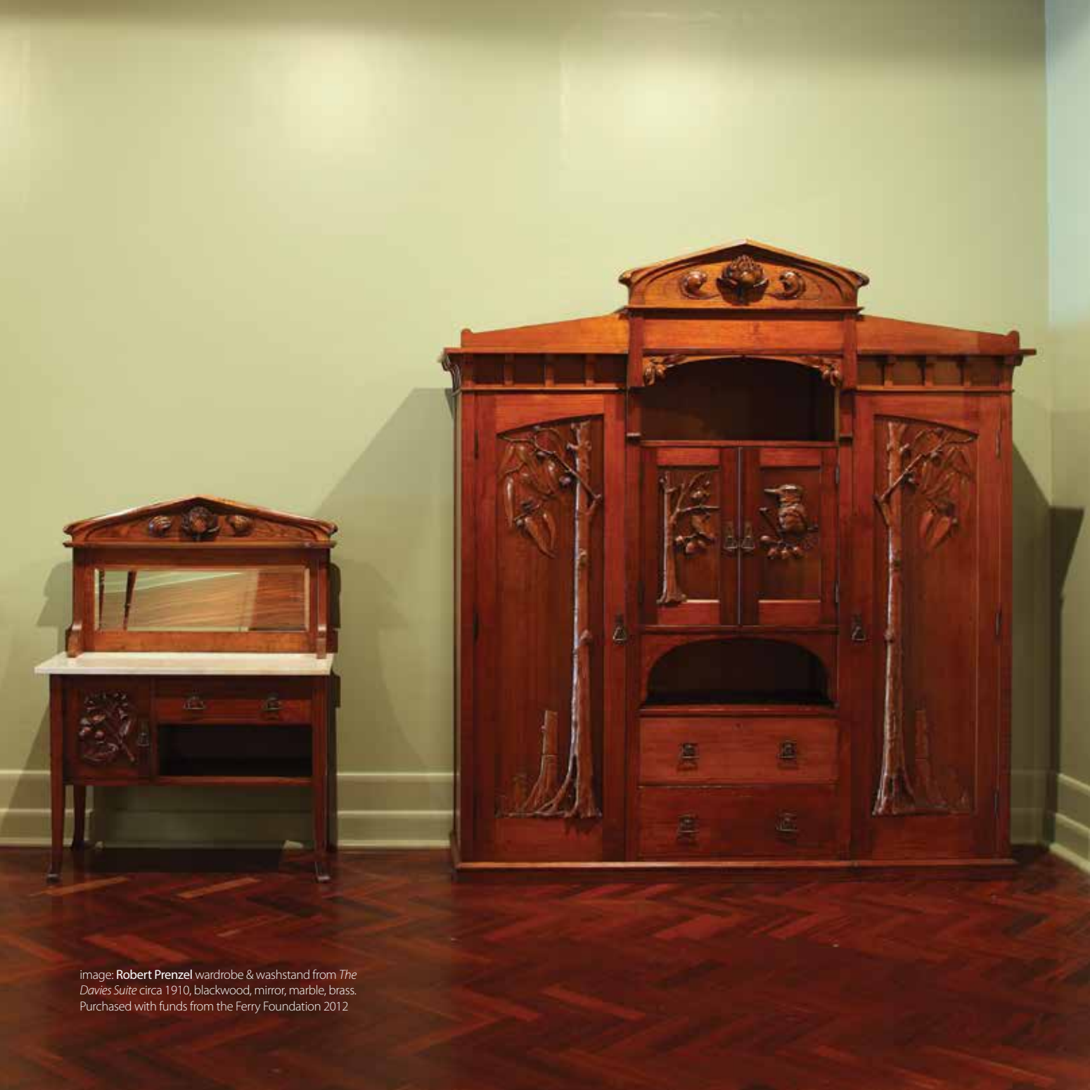
image: Robert Prenzel wardrobe & washstand from The Davies Suite circa 1910, blackwood, mirror, marble, brass. Purchased with funds from the Ferry Foundation 2012

Robert Prenzel The Davies Suite - wardrobe, dressing table & washstand circa 1910 blackwood, mirror, marble, brass Purchased with funds from the Ferry Foundation 2012