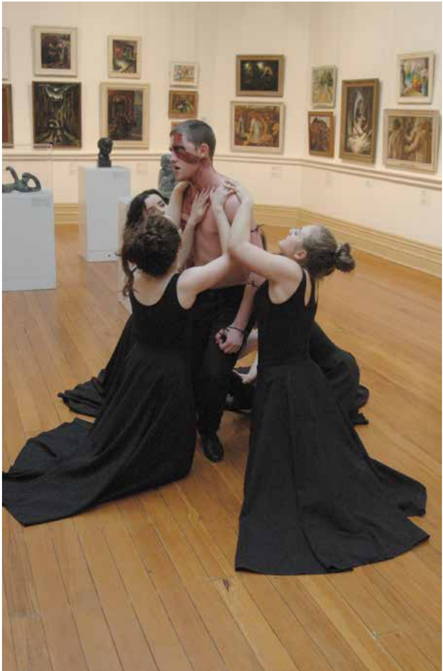
Image: First year Performing Arts students from University of Ballarat during the performance of Primitive Conversation .