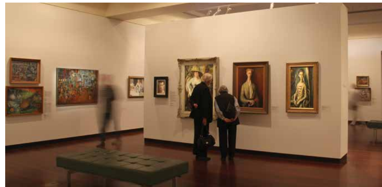
Image above left: A guiding hand: prints & directors at the Art Gallery of Ballarat 1967-2011 September 2011. Image above right: Australian Modern Masterpieces from the Art Gallery of New South Wales October 2011

24 September - 27 November 2011 Mars Gallery Timken Community Gallery Gordon Victor King Gallery