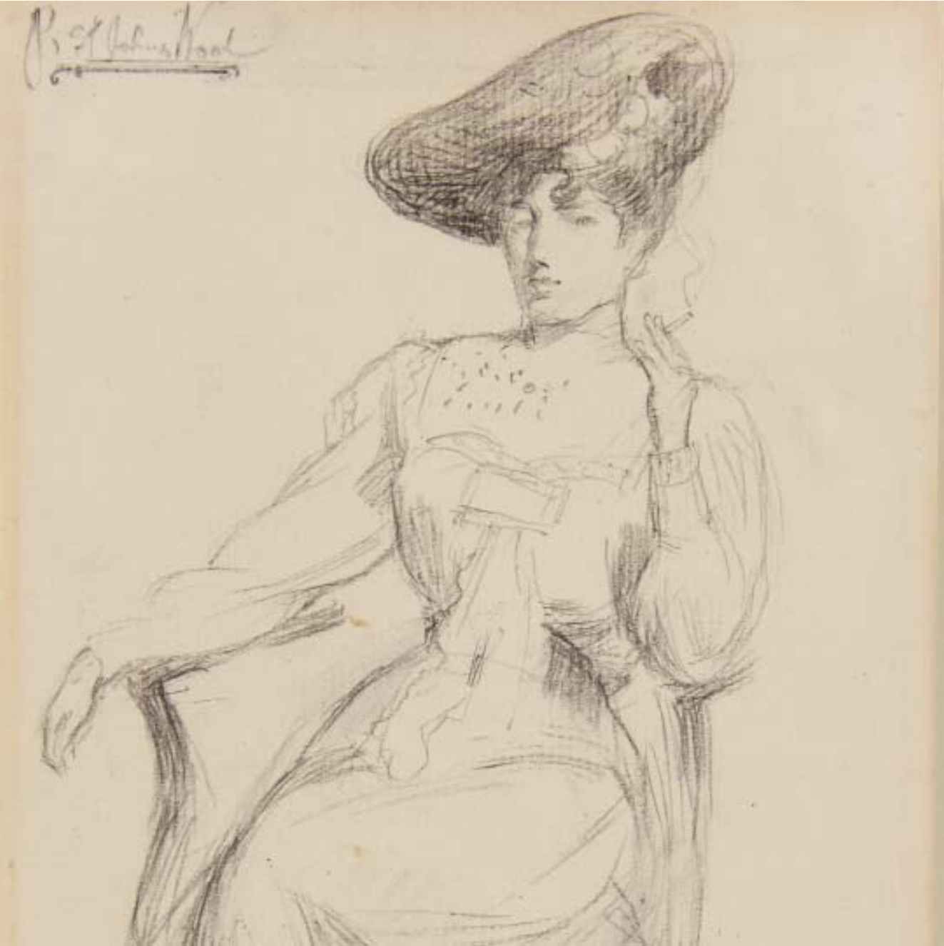
Image: Thea Proctor , Self portrait (detail), not dated, pencil on paper. Gift of Bob Bath, 2011

{Leckie Gallery} 3 botanical prints Purchased, 2011 after Piron, W. Sparrow , Richea glauca , 1800 after Piron, Warren , Exocarpos cupressiformis , 1800 Pierre-Joseph Redoute, Warren , Mazeutoxeron rufum , 1800 engravings on paper