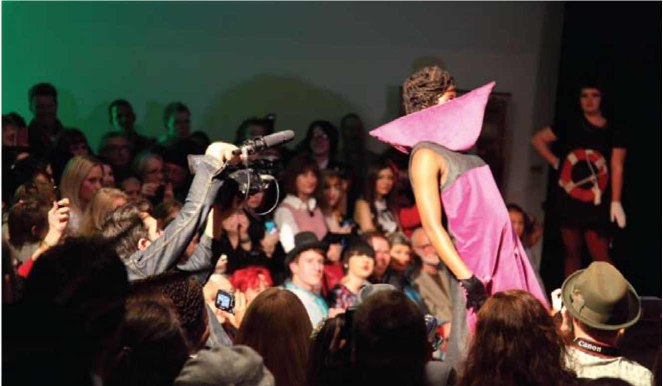
Let it all hang out: Australian Art of the 1970s 18 June - 7 August 2011 Ian Potter Foundation Gallery