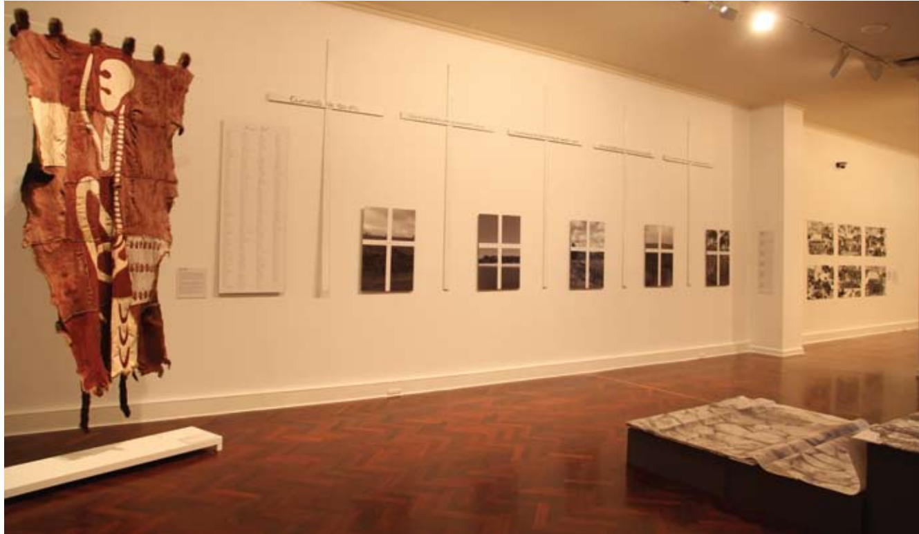
Rob Whitson: Foothills - Landscapes of the Indian Himalaya 5 February - 14 March 2011 Mars Gallery