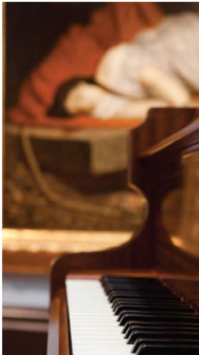
Image right: detail of James Oddie Gallery. Image next page: Crouch Gallery